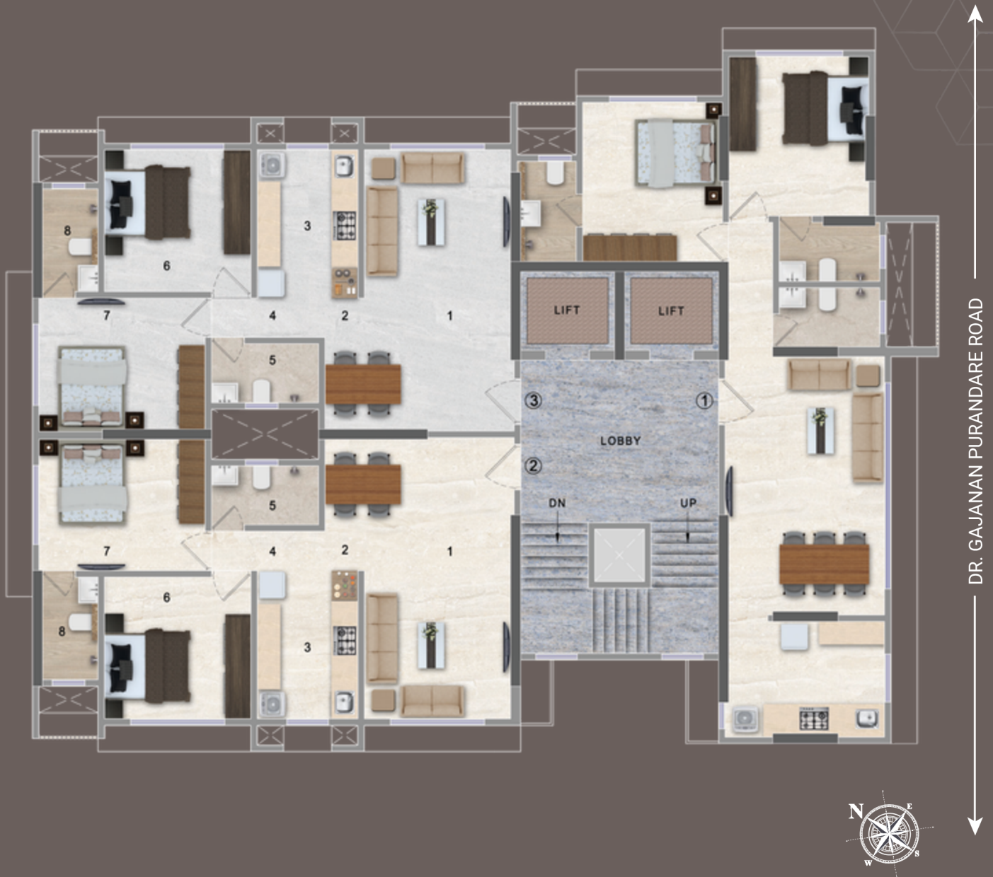
2 BHK RESIDENCE 719 SQ.FT.